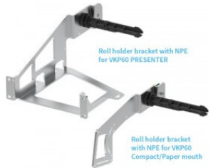
Roll holder bracket with NPE for VKP60 PRESENTER