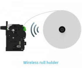
Wireless roll holder