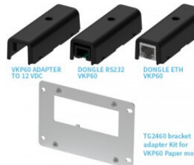
VKP60 ADAPTER TO 12 VDC