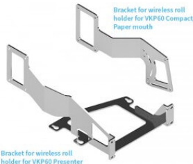
Bracket for wireless roll holder for VKP60 Compact/Paper mouth