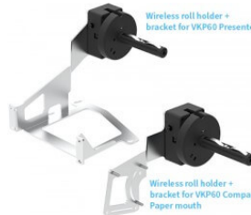
Wireless roll holder + bracket for VKP60 Presenter