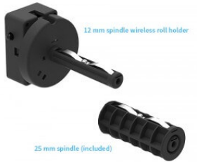
12 mm spindle wireless roll holder